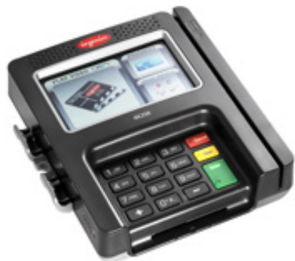
Ingenico® iSC 250